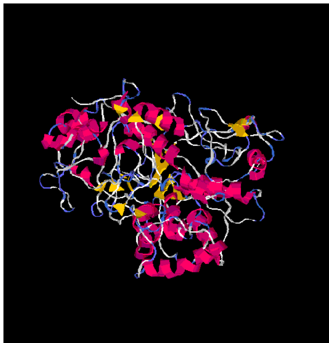
Fig 1. Ramachandran plot for the AFLR2-Protein model.

residues were found in the favored and 1.4% allowed regions and 0.5% were in the outlier region.